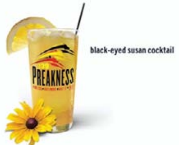
black-eyed susan cocktail

Combine the ingredients in a cocktail shaker with ice. Shake vigorously. Strain over ice into a double old-fashioned glass. Garnish with a lemon wedge or cherry.